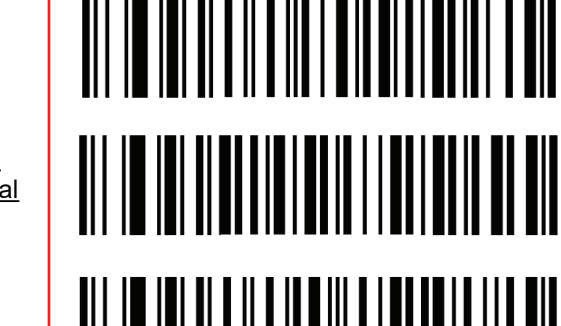
Factory Default: (Scan these three barcodes in vertical