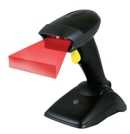
Model: NuScan 2500TR