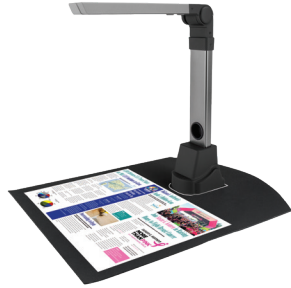
Model: Cybertrack 1200