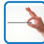
Ultra-Slim and Aluminum Design