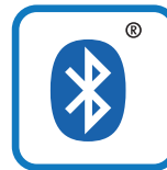
Bluetooth® 5.1 Wireless technology

With this wireless keyboard you will never have to buy batteries again due to it's built-in polymer rechargeable battery which is able to be recharged via computer USB port or USB power adaptor.