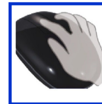
Touch Scroll Pad