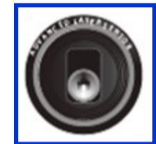
Enhanced Optical Engine