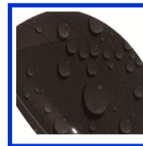
Water, Oil and Dust-proof