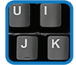
2X Letter Print Size