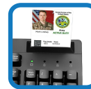
Smart Card Reader

The 2X size print on the keycaps provide excellent contrast and stronger appeal over traditional keyboards that have small, hard-to-read printing.