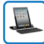
Universal Case Stand

Features subwoofer technology dedicated to the reproduction of low - pitched audio frequencies with (L/R) Left and Right speakers for high quality stereo sound.