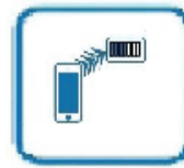
Rechargeable Li-Polymer Battery with IOS Indicator