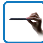
Ultra-Slim and Aluminum Design