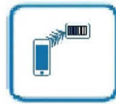
Rechargeable Li-Polymer Battery with IOS Indicator