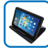
Easy Dock Access