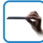
Ultra Slim Aluminum Design