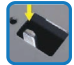
Emergency Release Lever