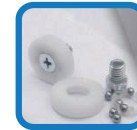
Ball Bearing Rollers