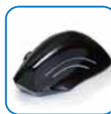
Vertical Ergonomic Design