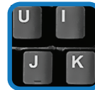
2X Letter Print Size