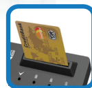
Smart Card Reader

The AKB-630SB-TAA - a TAA Compliant input device designed for GSA sales to government agencies, the military, their suppliers and vendors, and other organizations requiring end products manufactured to U.S. Trade Agreement Act Specifications.