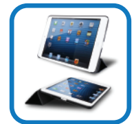
Multiple View Angles