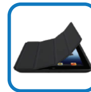
Automatically Lock/ Unlock iPad