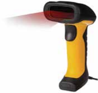
Model: NuScan 2400U